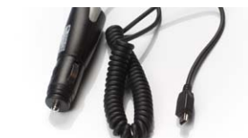
12-24V Car USB charger