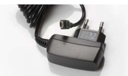
230V USB Charger