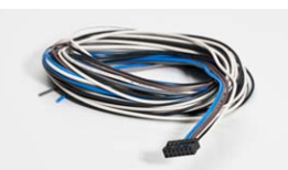
Cable for fixed mounting